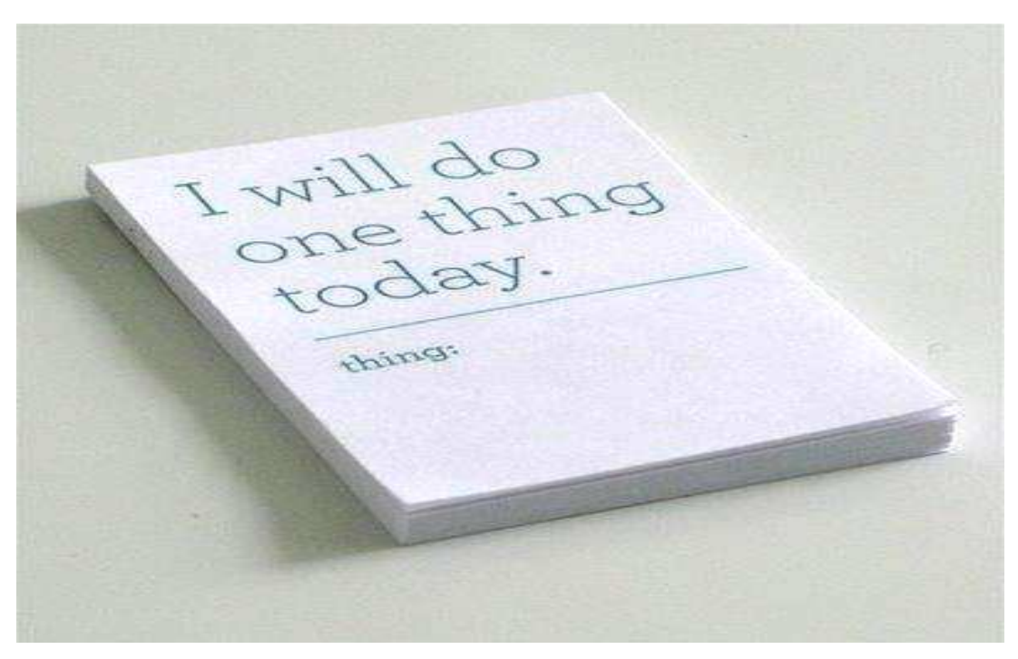
A Singapore Commitment

I came to AA, close to 16 years ago, to stop drinking, but found a new way to live instead,... without alcohol. It gave me a new way of thinking, which replaced the drinking. It started soon, with a sponsor that poured me into service early, but with baby steps and nothing more than I could handle. So within a year and a half, following several panel guest appearances, I was asked to chair a panel at a Hospital's behavioural health unit on Saturday mornings... and have continued doing it for over 14 years.